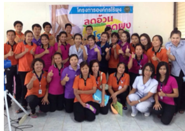
More than 50 organizations where performing public speaker and workshop in health and nutrition topic