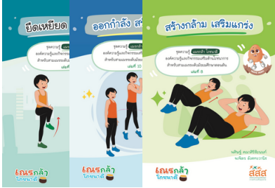
Manual for “Exercise for Thai monk” under “Song Thai Glai Roak” project