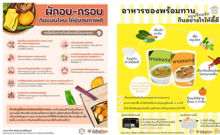
Content and article creator for “Network of Fatless Belly Thais”